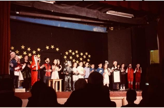
1<sup>st</sup> and 2<sup>nd</sup> Class having a Toys Christmas!