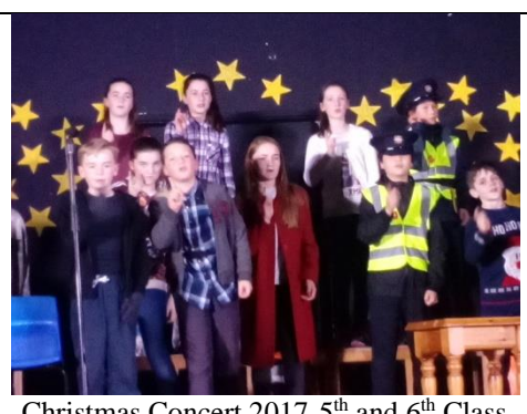
Christmas Concert 2017-5th and 6th Class