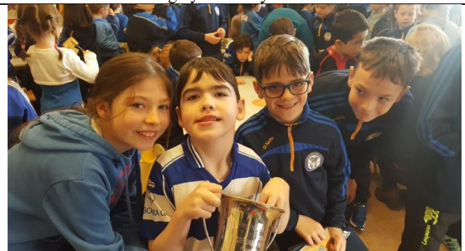
Students posing with one of Inniscarra's cups from the season