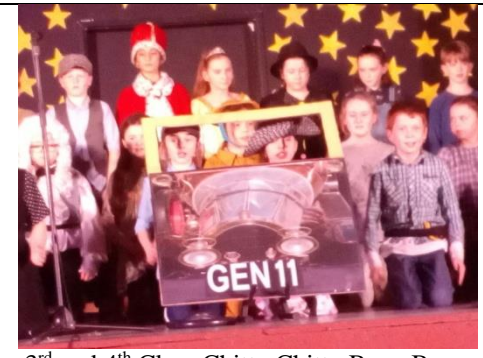
3<sup>rd</sup> and 4<sup>th</sup> Class Chitty Chitty Bang Bang