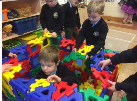
Infants building during their Aistear programme.