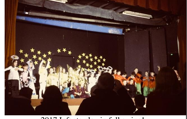
2017 Infants play in full swing!