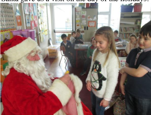
Santa gave us a visit on the day of the holidays!